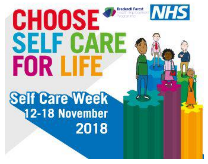
Figure 2 - Self Care Week logo 1